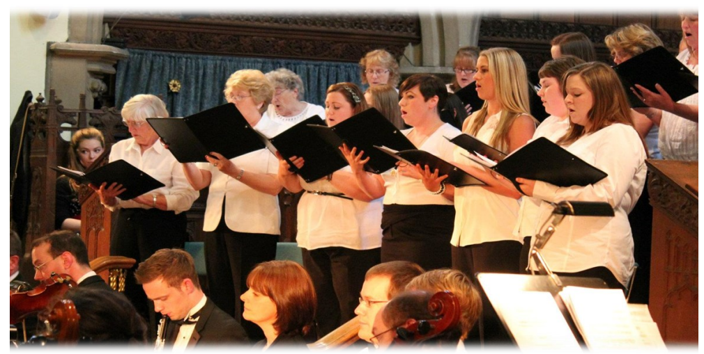
A concert by the community for the community